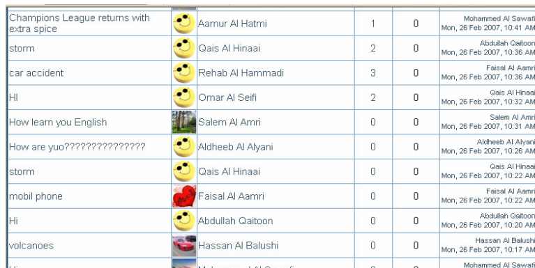
Figure 3: Online Interaction and Threaded Discussions